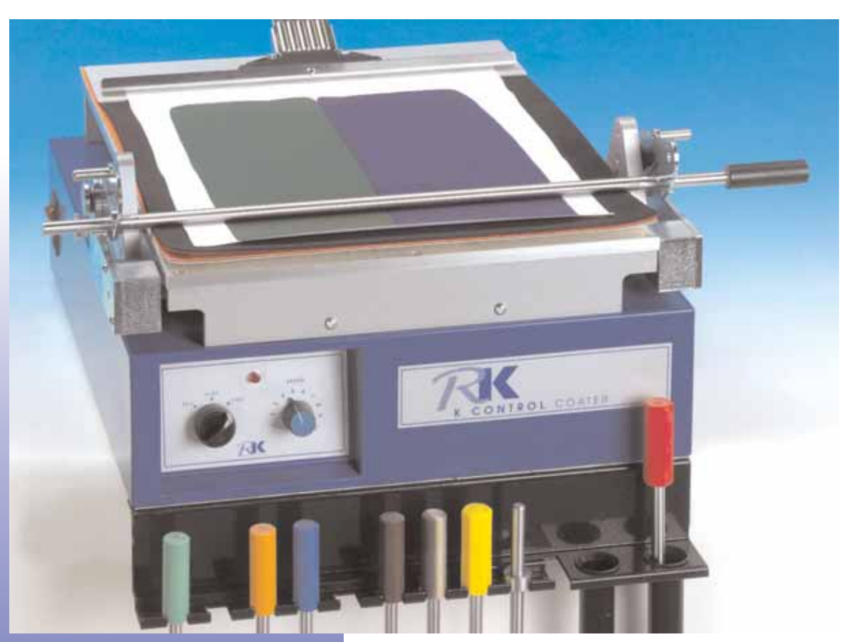
Above: K control Coater model 202.